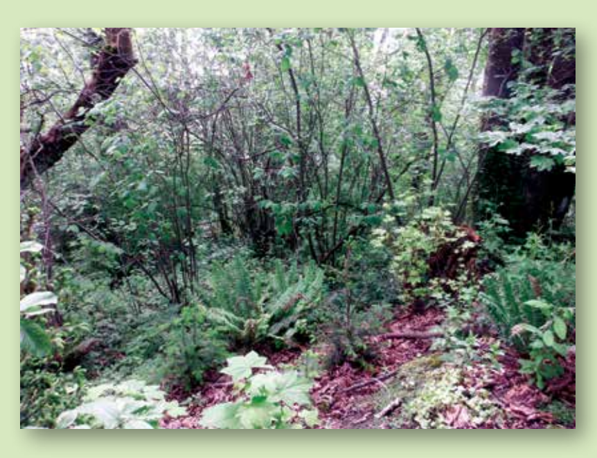
LESCHI NATURAL AREA