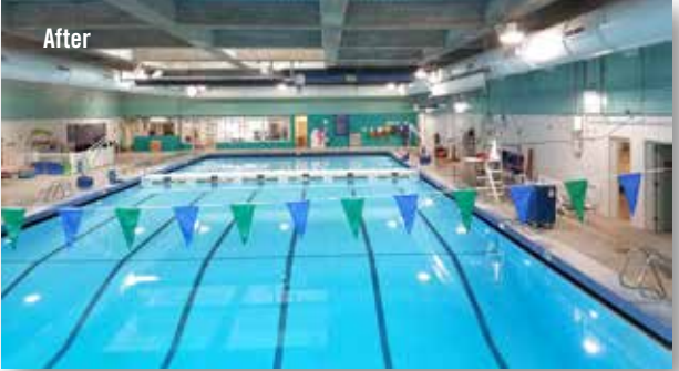
MEDGAR EVERS POOL PROJECT