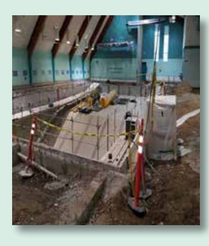
BALLARD POOL PROJECT